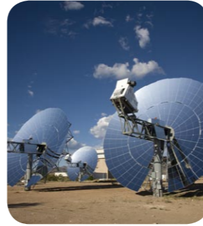
NTR Group Projects